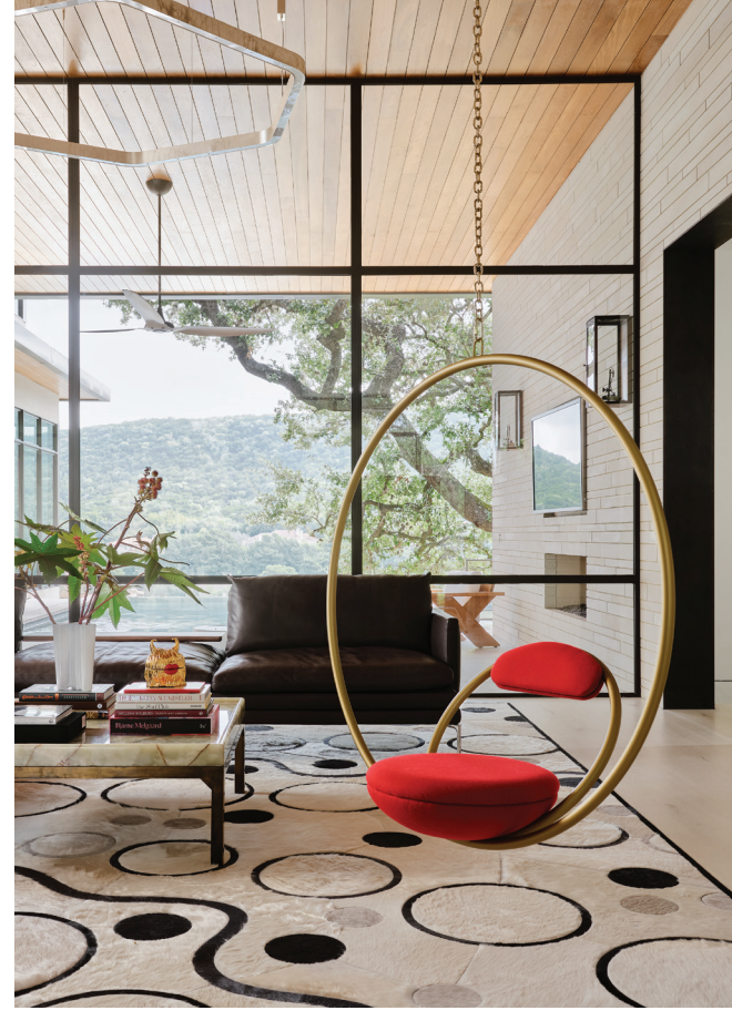
Framed with gold, a hanging red chair in the living room of the Cliffside House injects a lighthearted note.

Light also plays into the feelings a space